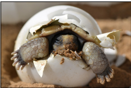
Hatching Desert Tortoise