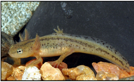
Young California Newt