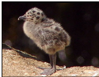
Western Gull Chick