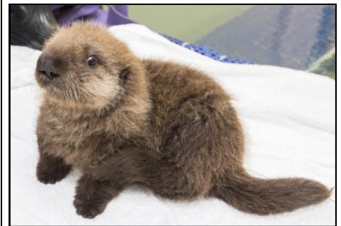
Sea Otter Pup