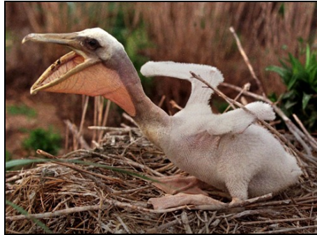
Brown Pelican Nestling