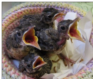
American Robin Babies