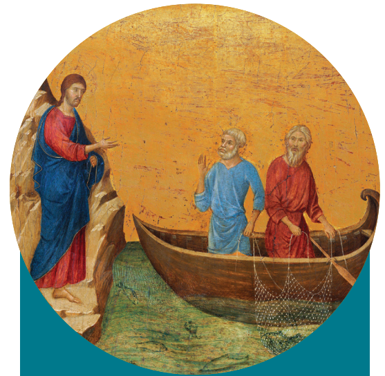
The Calling of the Apostles Peter and Andrew by Duccio di Buoninsegna (circa 1308)