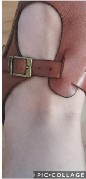
After (top photo) vs Before (Bottom two photos)