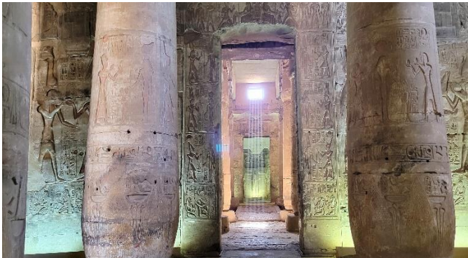
Temple of Abydos