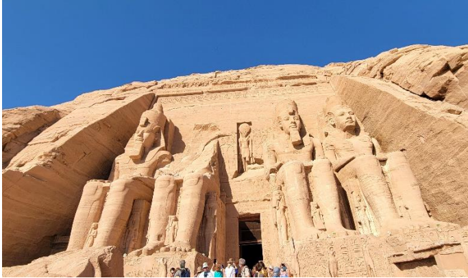
Temple of Ramses II