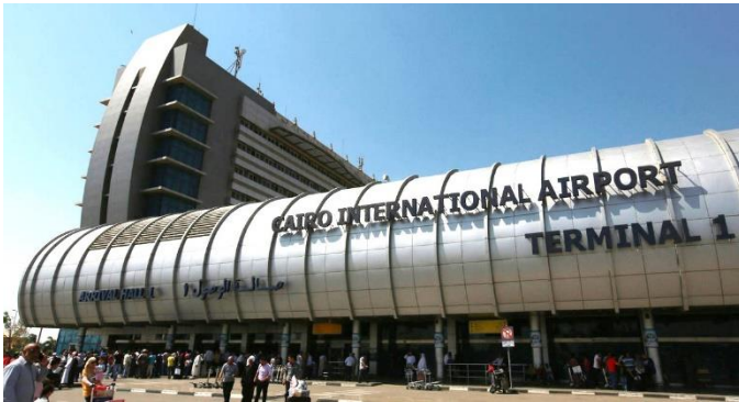
Cairo International Airport