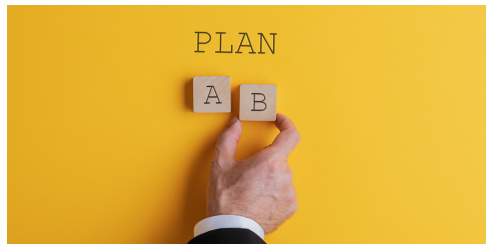
LIFE PLANNING AND GOAL SETTING