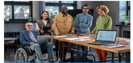
WORKPLACE DIVERSITY AND INCLUSION