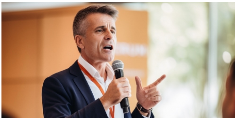
COMMUNICATION SKILLS FOR BUSINESS